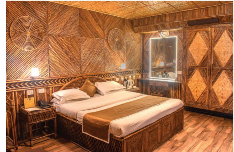
HOUSE OF BAMBOO